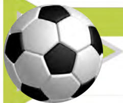
LO SANTOS CAMPEÓN 2018 SOFTBOL FEMENINO

On the other hand, Los Santos was the champion in the 2018 edition of the National Women's Softball Championship, with the province of Colón being the sub-champion, followed by Panama Metro in third place and Herrera in fourth..